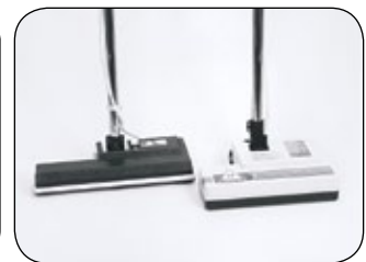
Power Nozzle 430/499 28389/28392