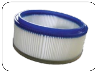
Hepa Cartridge Filter 26099 (small)