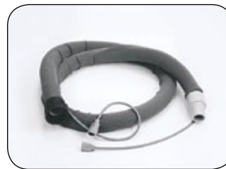
Power Nozzle Hose Assembly 28993