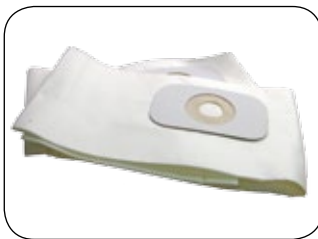
Filter Bags (10 pk) 28501 (small)